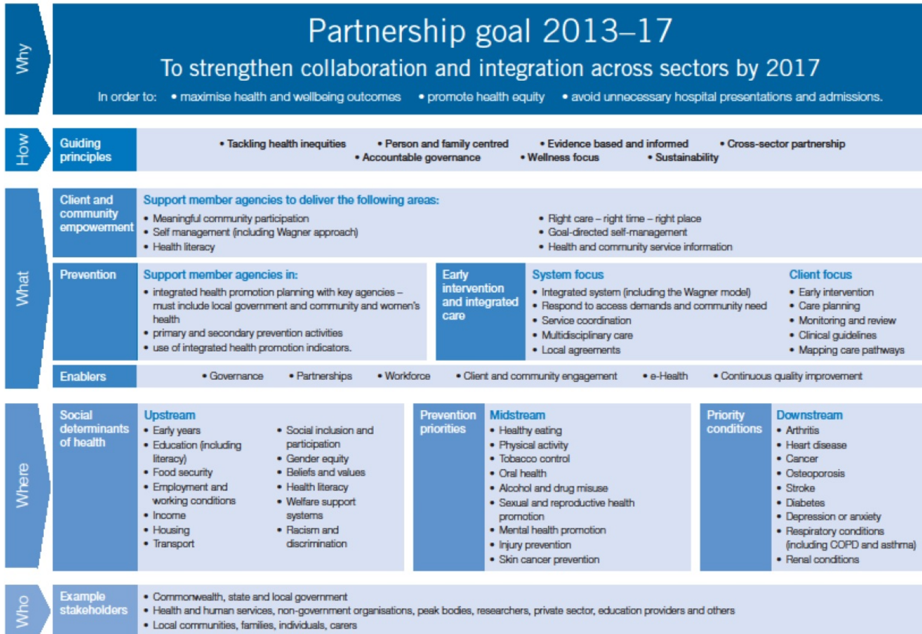
Figure 1: PCP program logic 2013–17